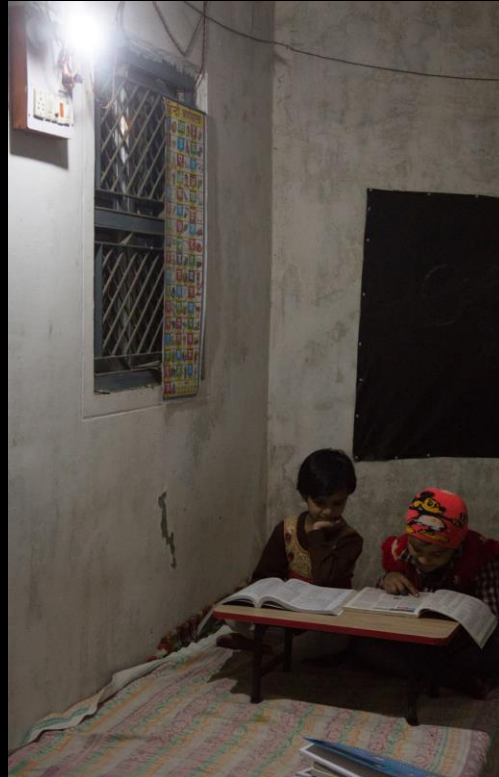
Dimple , Sariswa bazar

Easier to read and more time for playing